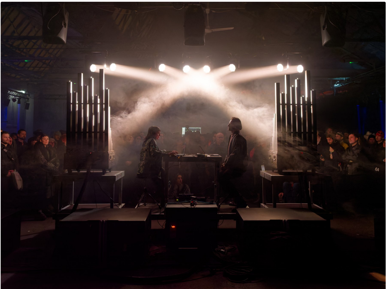
BLACK SQUARE live @ CTM Festival 2026, Berlin

At a glance: Fully acoustic, no PA · Touring party: 2 persons · Setup approx. 1 h, strike approx. 30 min · Min. clear height above stage: 3.0 m · Power: 4 × schuko (230 V / 16 A) · Venue crew for setup: min. 4 persons